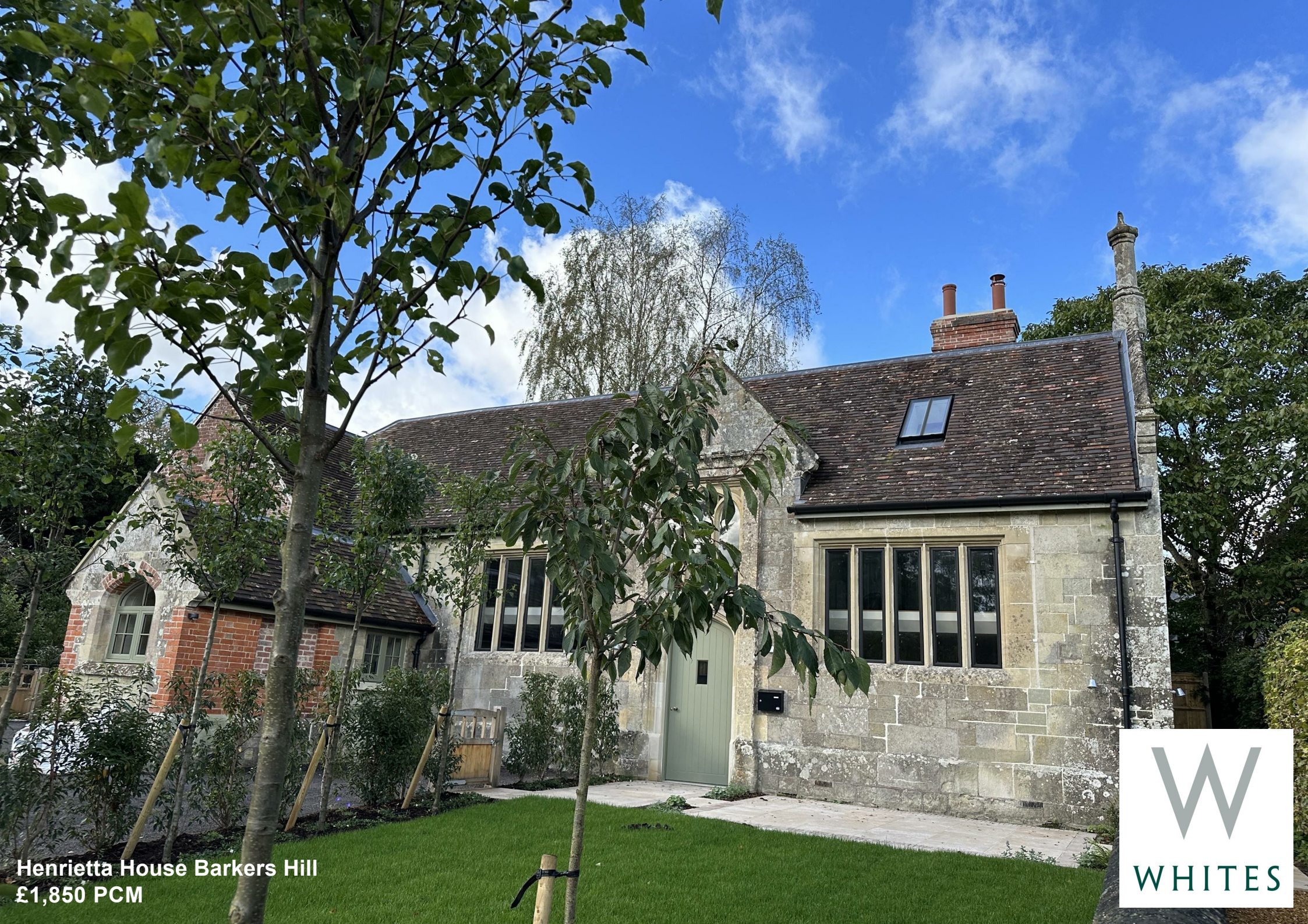
Henrietta House Barkers Hill £1,850 PCM